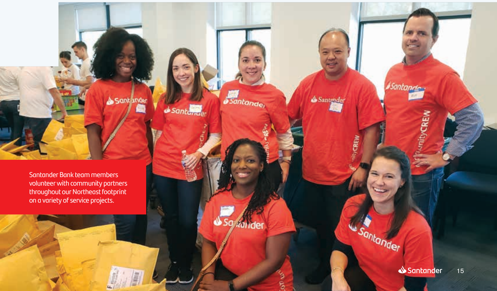
Santander Bank team members volunteer with community partners throughout our Northeast footprint on a variety of service projects.

Worcester Common Ground, Inc. Worcester Community Housing Resources, Inc. Worcester Educational Development Foundation Inc. Worcester State University Worcester Youth Center, Inc. Work Options for Women Working in Support of Education Workshop in Business Opportunities, Inc. Wynnefield Overbrook Revitalization Corporation Year Up Inc. York College York County Library System Young Men's Christian Association of Reading and Berks Counties Young Men's Christian Association of Greater Boston Young Men's Christian Association of Pawtucket, RI Young Men's Christian Association of Trenton, NJ Young Women's Christian Association Young Women's Christian Association of the Hartford Region Inc. Youth Consultation Service, Inc.